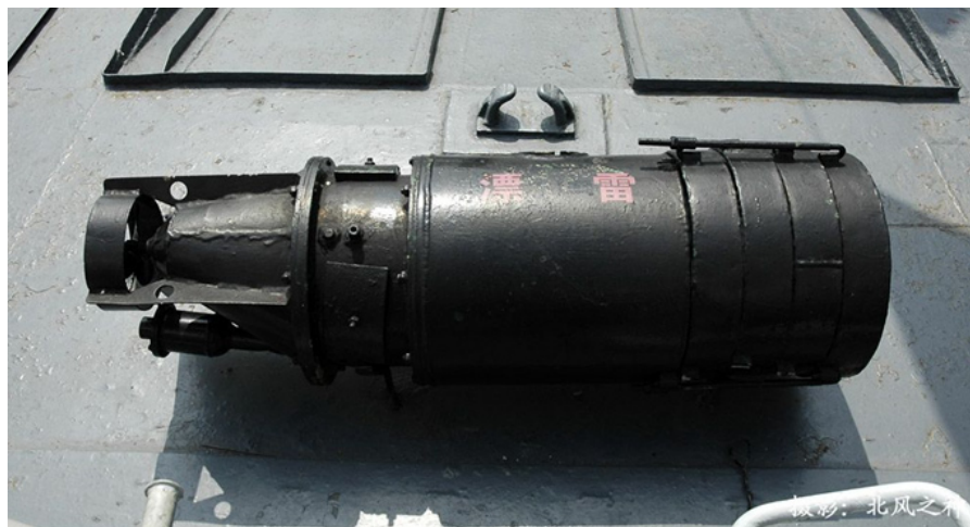
Photo 3. Piao Drifting Mine. The PLAN has produced large numbers of free-floating mines, although the current status of production, inventory, and deployment is unclear.

developed a third-generation drifting mine, the Piao-3, that oscillates at a depth of between two and seven meters. 87 Such drifting mines might be particularly useful for denying surface vessels access to waters east of Taiwan, particularly those too deep for rising mines.