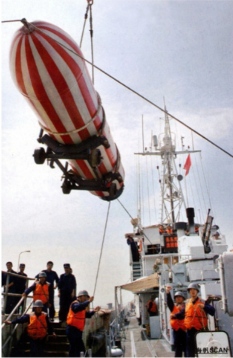
Photo 4. Laying a Training Bottom Mine. A crane, adequate deck space, GPS, and a low sea state are the conditions required to lay mines such as this bottom mine exercise shape.

simplicity of command and control. Disadvantages include a lack of stealth, limited speed, and consequent vulnerability. 186