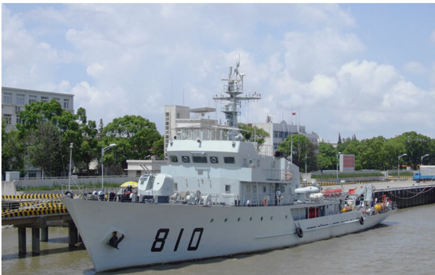
Photo 1. Wochi-Class Mine Countermeasures Ship. Jane’s Fighting Ships lists six of these, which are apparently built at two shipyards, and mentions that they are similar to, but five meters longer than, the older T-43 Soviet-designed minesweepers that China built previously.

It would be a mistake to dismiss PLAN minesweeper development, however. Qiuxin Shipyard is reported to have launched a “new class” of six-hundred-ton minesweepers on 20 April 2004. 71 A daily newspaper published by the political department of the PLA’s Guangzhou Military Region reports that in 2005 the PLAN made “achievements of development of training and operational methods for new equipment represented by new-type minesweepers.” 72 Since 2005 the PLAN has taken delivery of two new, indigenously built types of MCM vessels: six of the Wochi class, and an as-yet single-ton Wozang class. 73 Of particular interest, China Central Television’s military channel,