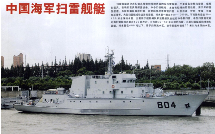
Photo 9. PLAN Mine Countermeasures Ship 804. This is one of China's most modern mine countermeasures ships. This ship has exercised with a remotely operated mine-hunting underwater unmanned vehicle and using what appear to be sophisticated, high-frequency active digital sonars.

operated mine-hunting underwater unmanned vehicle, described as a “new type of mine clearing device” and using what appear to be sophisticated, high-frequency, active digital sonars. 303