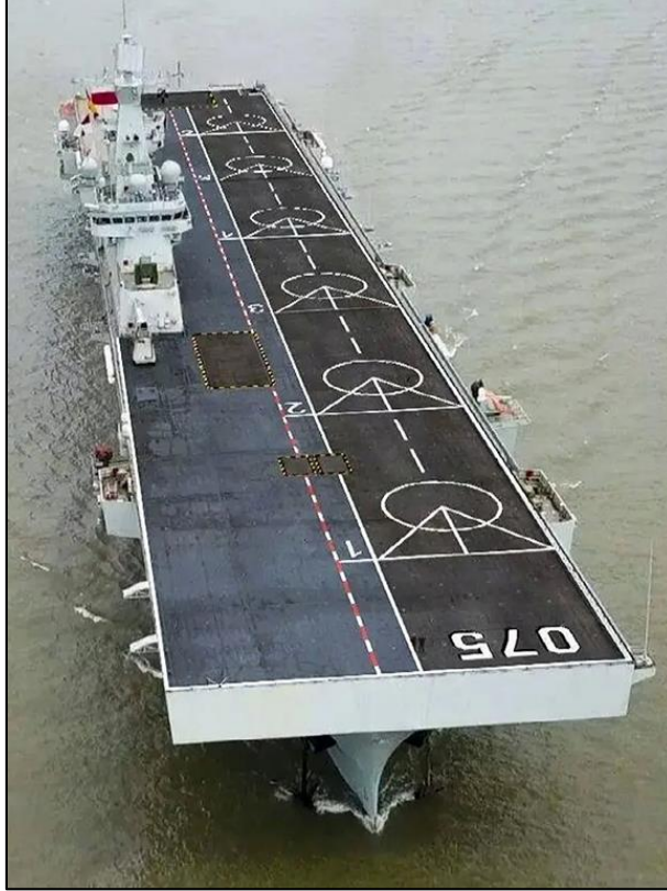
Figure 20. Type 075 Amphibious Assault Ship

Possible Type 076 Catapult-Equipped Amphibious Assault Ship