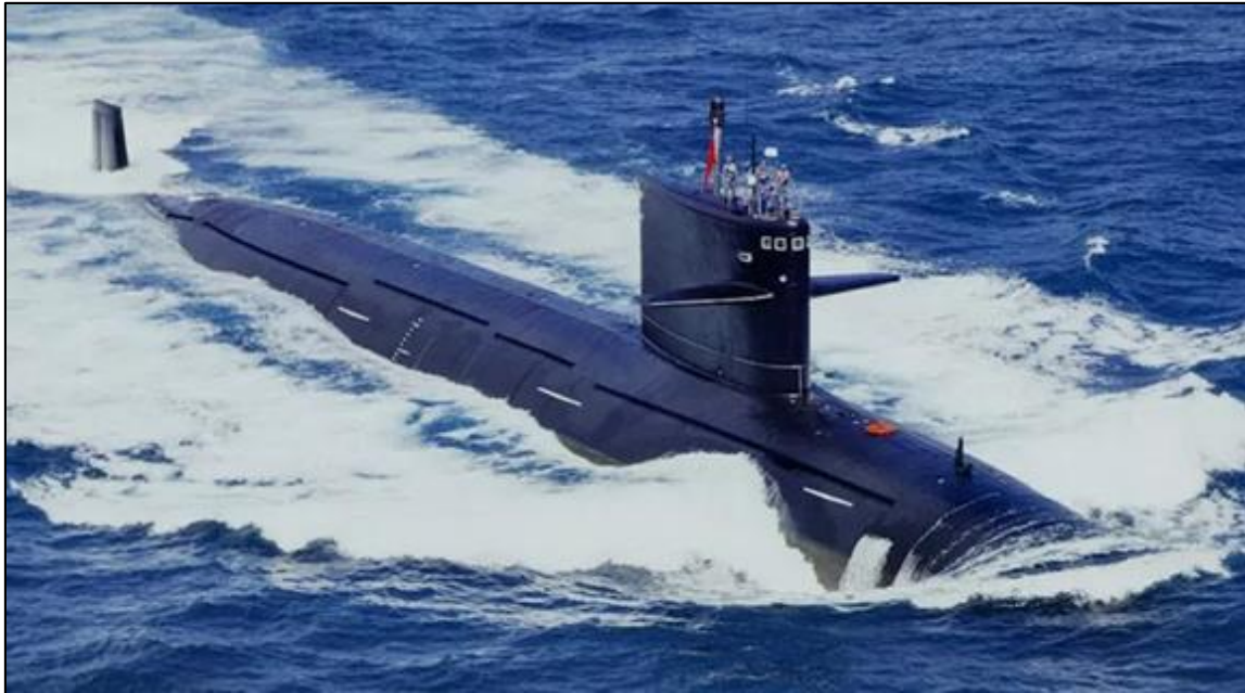
Figure 7. Shang (Type 093) Attack Submarine (SSN)