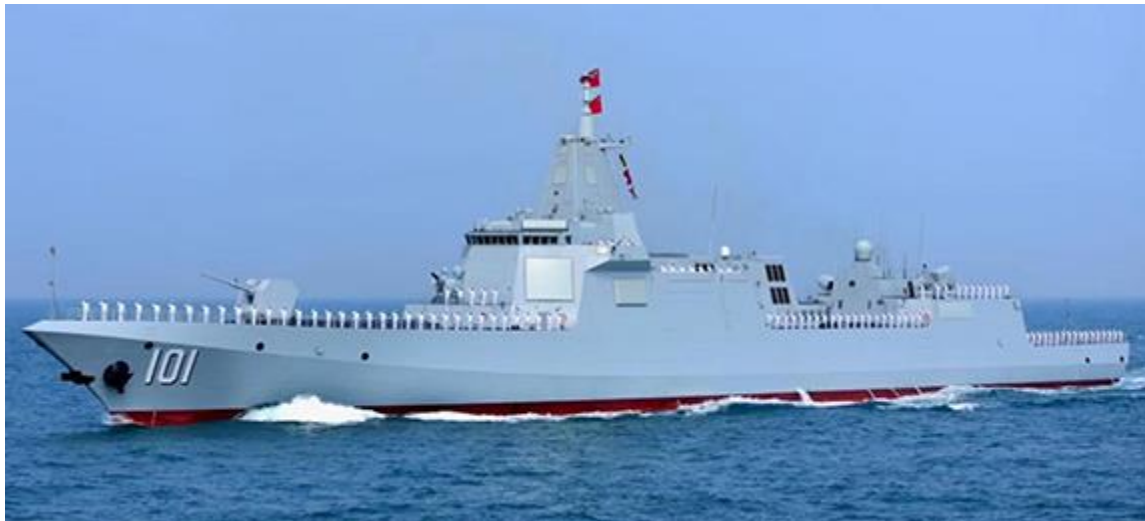
Figure 13. Renhai (Type 055) Cruiser (or Large Destroyer)