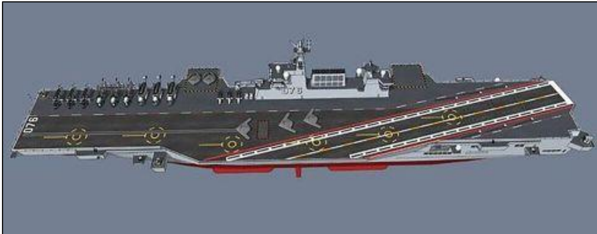
Figure 22. Notional Rendering of Possible Type 076 Amphibious Assault Ship