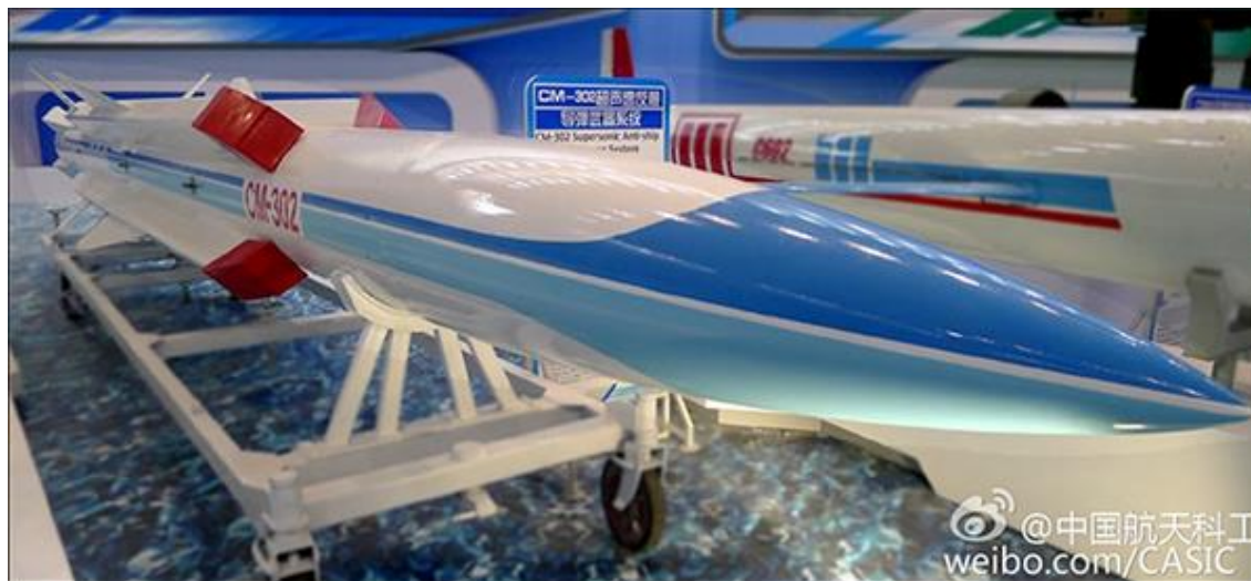
Figure 3. Reported Image of Anti-Ship Cruise Missile (ASCM)

Source: Detail of photograph accompanying Pierre Delrieu, “China Promotes Export of CM-302 Supersonic ASCM,” Asian Military Review , July 3, 2017. (The article states “This is an article published in our December 2016