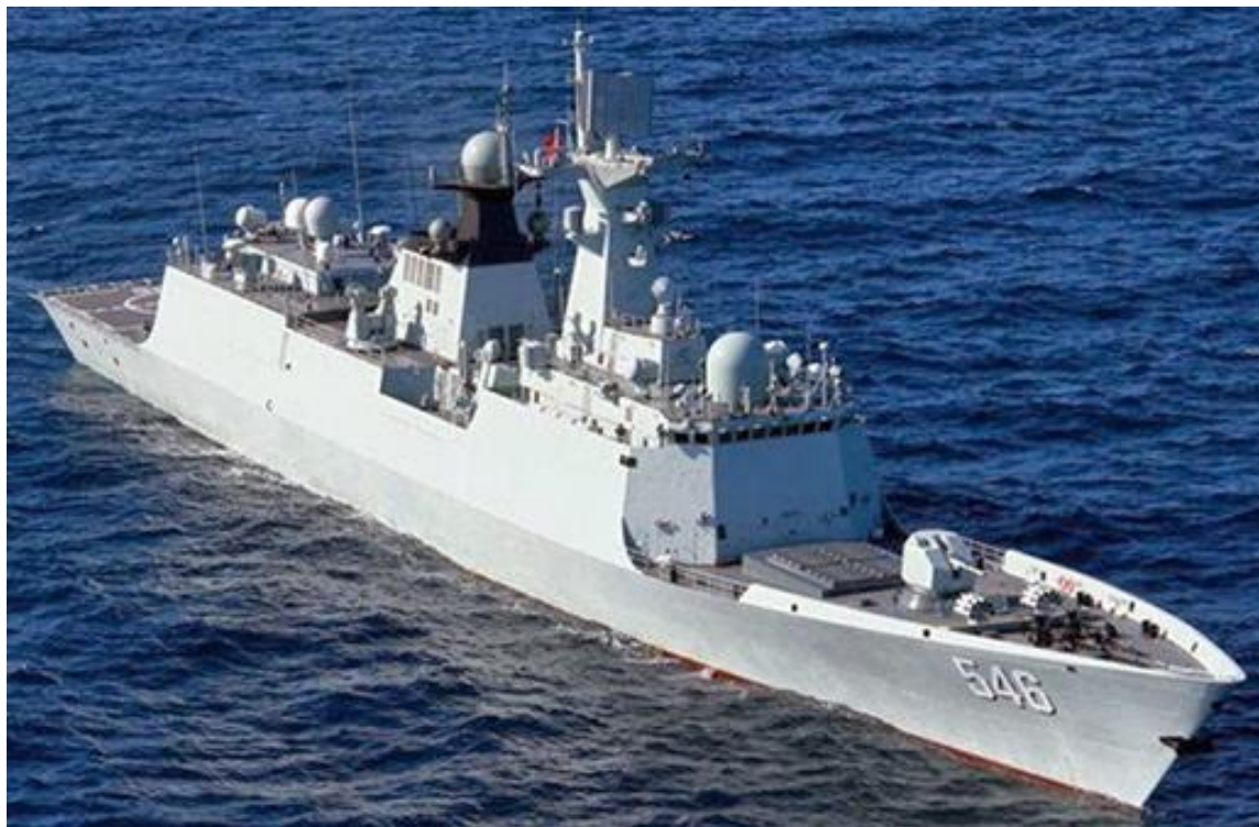
Figure 16. Jiangkai II (Type 054A) Frigate