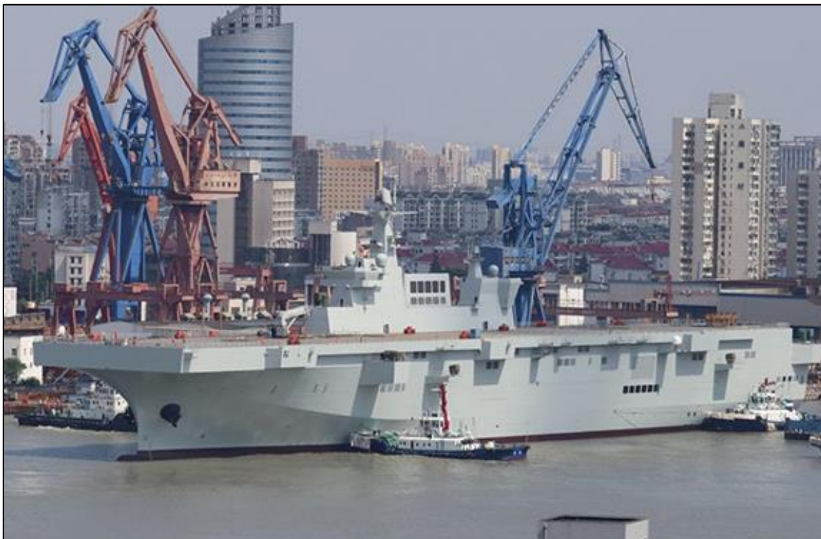
Figure 19. Type 075 Amphibious Assault Ship