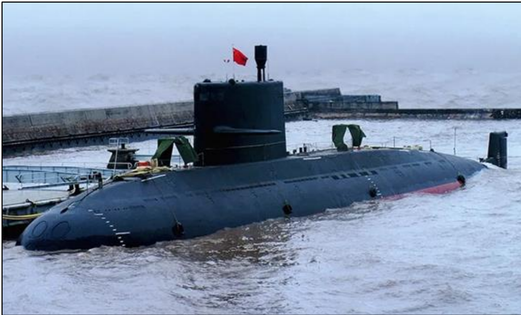
Figure 6. Yuan (Type 039) Attack Submarine (SS)