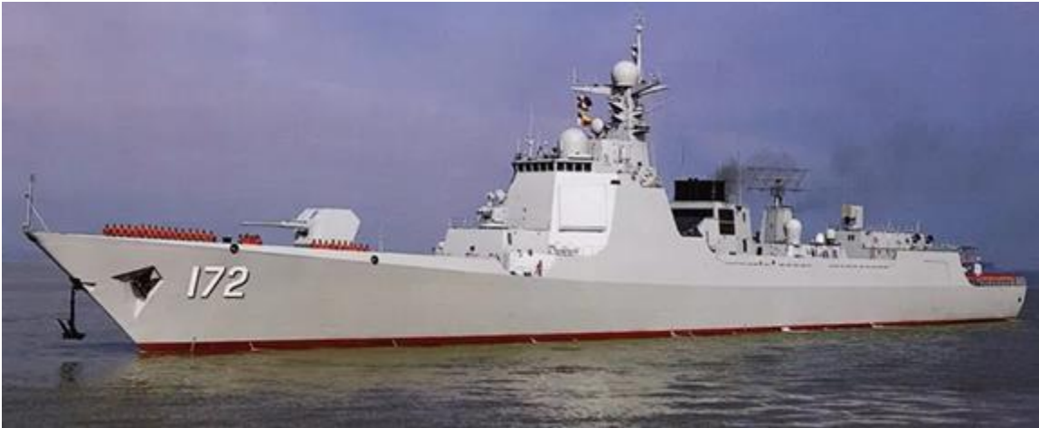
Figure 15. Luyang III (Type 052D) Destroyer