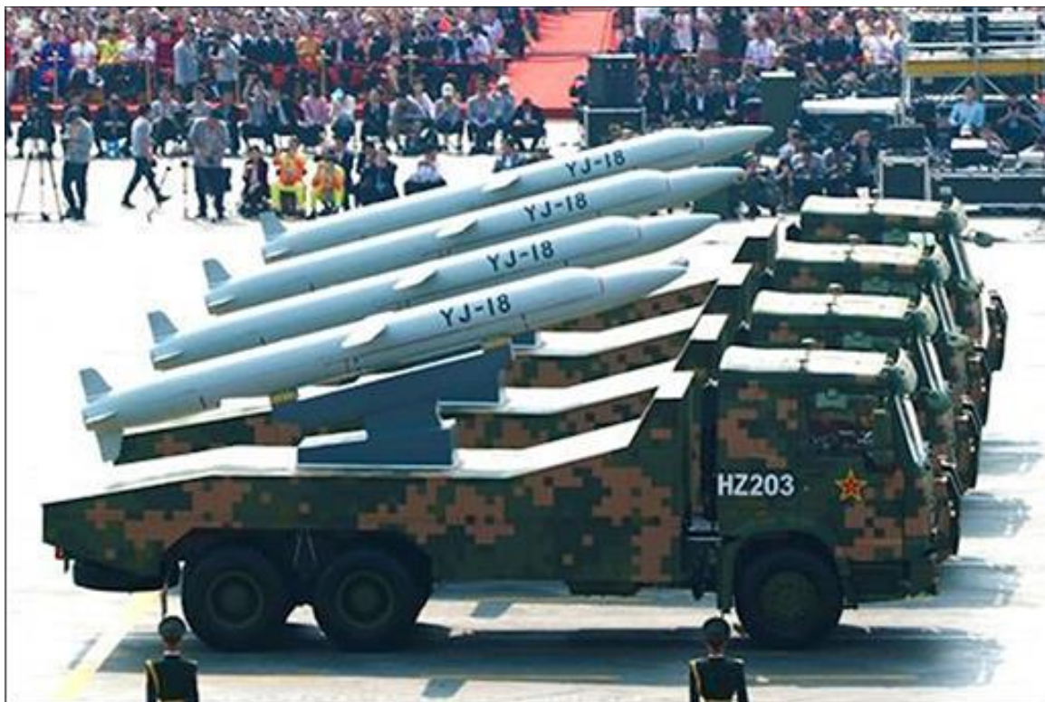
Figure 4. Reported Image of Anti-Ship Cruise Missile (ASCM)

The article states “A grand military parade was held in Beijing on 01 October 2019 to mark the People’s Republic of China’s 70 th founding anniversary.... One weapon featured was a new generation of anti-ship missiles called YJ-18. China unveiled YJ-18/18A anti-ship cruise missiles in the National Day military parade in central Beijing.”)