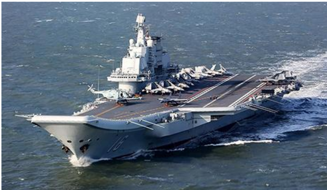
Figure 9. Liaoning (Type 001) Aircraft Carrier