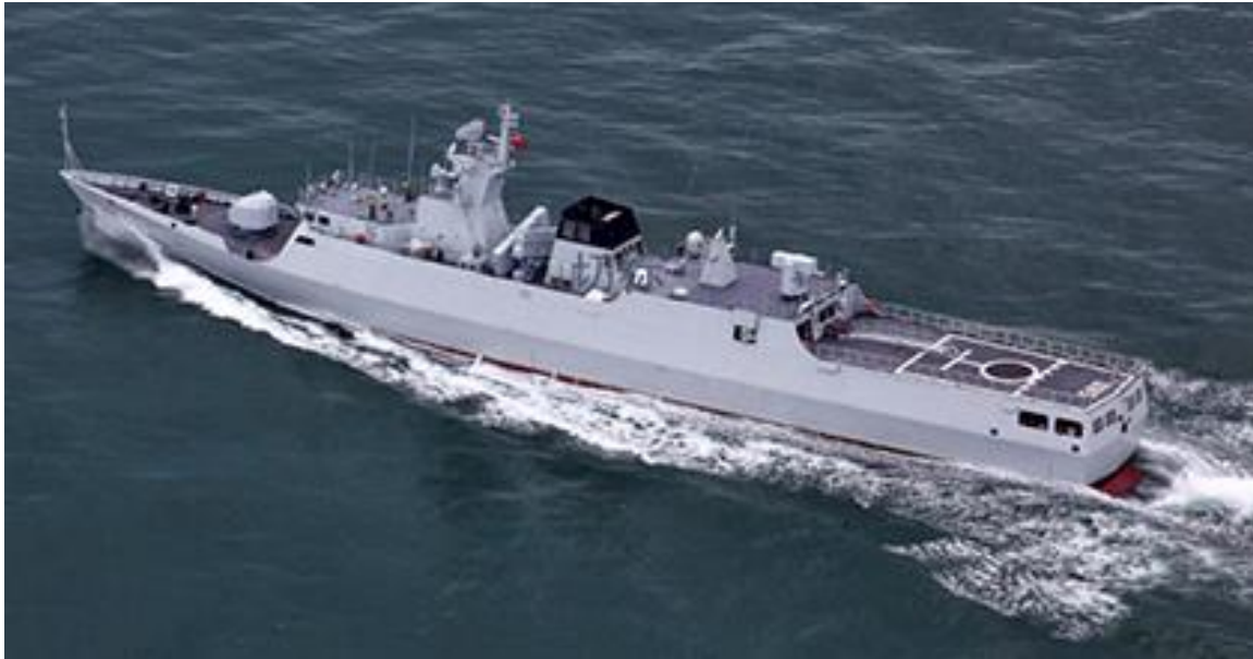
Figure 17. Jingdao (Type 056) Corvette