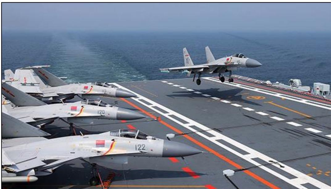
Figure 12. J-15 Flying Shark Carrier-Capable Fighter